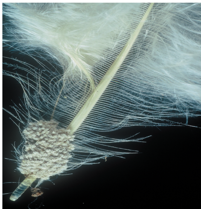
Figure 1. Lice eggs at the base of the feather shaft

The Chicken Mite is a nocturnal mite that is primarily a warm weather pest. These mites suck the blood from the birds at night