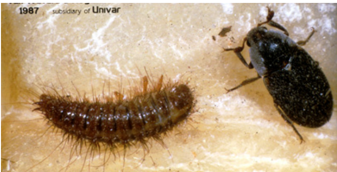
Lesser mealworm larva and adult

Hide beetles are larger than darkling beetles, about 1/3 inch long. Scavenging hide beetles feed on bird carcasses, skins, hides, feathers, dead insects, and other animal and plant products. Broken eggs and dead bird accumulations in the manure enhance hide beetle populations. Development ranges from 20 to 45 days or more. Mature larvae often bore into wood posts, beams, and paneling to pupate. Adult hide beetles can live from 60 to 90 days.