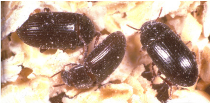
Lesser mealworm beetle adults

time in the manure or litter feeding on damp and moldy grain sources. Development ranges from 40-100 days, depending on temperature. When mature, larvae seek drier areas of the manure or litter and crack and crevice areas to pupate. They will bore into walls and can destroy house insulation in seeking areas to pupate. Once adult beetles emerge, they can live from 3 months to a year.